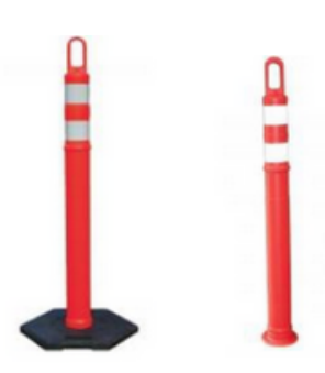
Looper Tubes with or without base